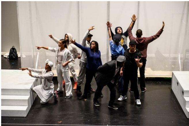
The cast of We Shall Not Be Moved rehearses during a March 2017 workshop in Philadelphia.